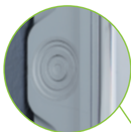
Flexible cable entries.

Particularly suitable for: Sports grounds, external staircases, garages, industrial premises, swimming pools.