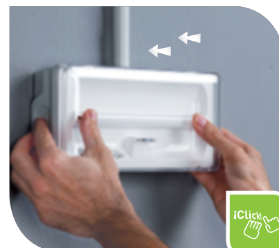
Product snaps shut.