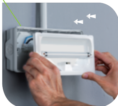
On completing work, plug the reflector into the base.