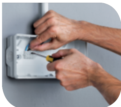
Ample space for cable handling and storage. Connected via 2 x 2.5 mm 2 screw terminals.

Particularly suitable for: Sports grounds, external staircases, garages, industrial premises, swimming pools.